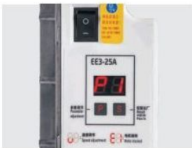
Easy operation, quick response