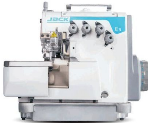
Power saving, easy operation