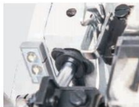
Fully enclosed needle bar oil return device, clean sewing