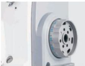
Integrated handwheel design